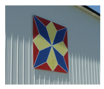
Blue Diamond Farming Company - Jesup 26b. 11607 Rickard Road

"We farm with our son with the logo 'Blue Diamond Farming Company' and have the diamonds on various trucks and machinery.