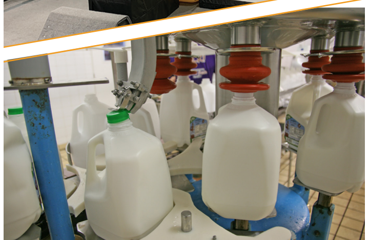
Barns, Brews and Kangaroos