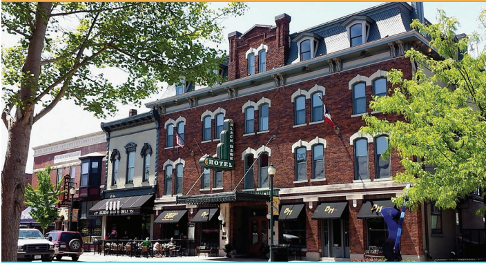
Historic Route 20