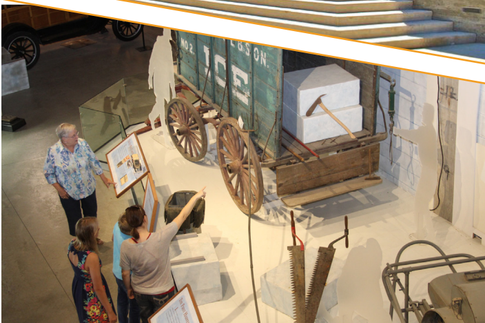
Grandparents, Grandchildren & Grand Times!