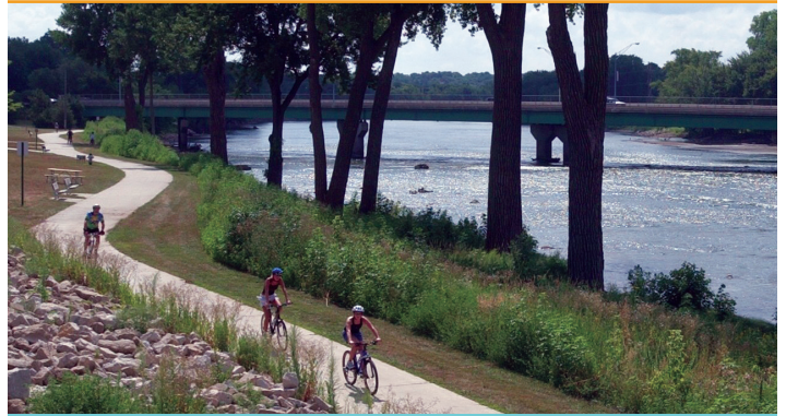
Create Your Adventure